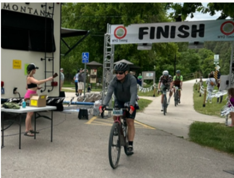
Kirby crossing the 2024 finish line

The ride is well organized, and the scenery is beautiful. If you are into gravel riding, I would highly recommend this event. Plus, the area is full of history and is a great place for a short vacation. Check out the 2025 event here: